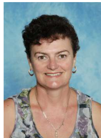
Ms Strydom College Chaplain

The College Nurse is involved in health education, health promotion and early intervention. The position involves providing accurate information to enable students to make informed decisions about health care. In addition, the College Nurse seeks to support parents/caregivers in the care of adolescent children.