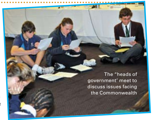
The "heads of government" meet to discuss issues facing the Commonwealth

The meetings that the students attended were very similar to those participated in by the real heads of government at the official CHOGM in October this year.