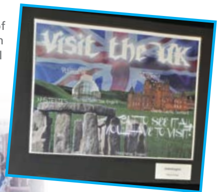
Kristie Read's tourism poster for the United Kingdom.